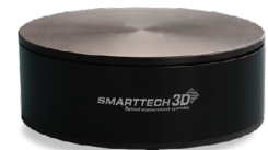
Automatic Rotary Stage: